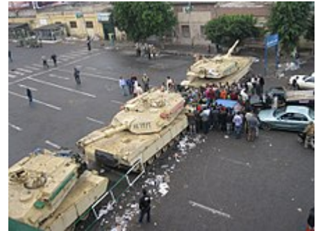
Martial law in Egypt: Egyptian-flagged tanks man an apparent checkpoint just outside the midtown Tahrir area during the 2011 Egyptian revolution.

On May 18, 2003, during a military activity in Aceh , under the order of the president, Indonesian Army Chief imposed martial law for a period of six months to offensively eliminate the Acehnese separatists.