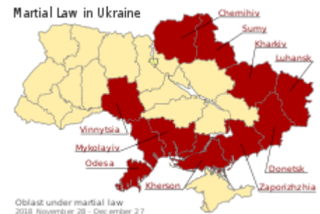
2018 martial law in parts of Ukraine

On 26 November 2018, lawmakers in the Ukraine Parliament overwhelmingly backed the imposition of martial law along Ukraine's coastal regions and those bordering Russia and Transnistria, a breakaway state of Moldova which has Russian troops stationed in its territory, in response to the firing upon and seizure of Ukrainian naval ships by Russia near the Crimean peninsula a day earlier. A total of 276 lawmakers in Kiev backed the measure, which took effect on 28 November 2018 and will automatically expire in 30 days. [34]